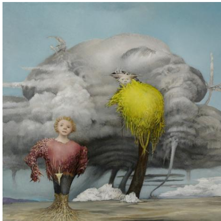
"Après le déluge"

(Exhibition runs from June 15 - July 11, 2013)